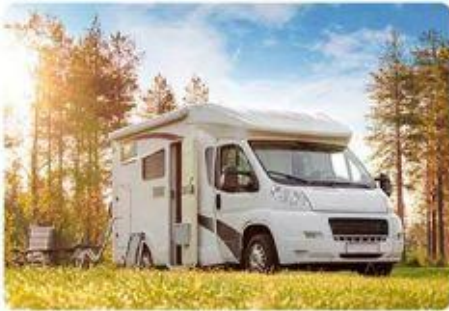
Power supply for motorhomes and ships