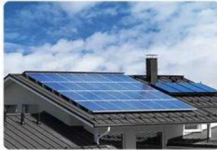
Home PV system