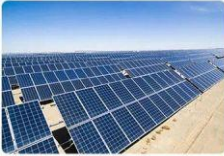
PV power station system

Home PV,RV power supply,PV power station,Base station power supply system