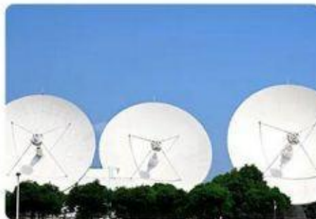
Communication base station monitoring power supply system

Wenzhou Olaite New Energy Co., Ltd. Address: Yueqing Economic Development Zone, Zhejiang Province Tel: +86-15167879755